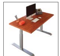
Workrite worksurfaces come in a variety of shapes and sizes.

They can also be used to refresh the look of your existing fixed height or adjustable height workcenters regardless of manufacturer.